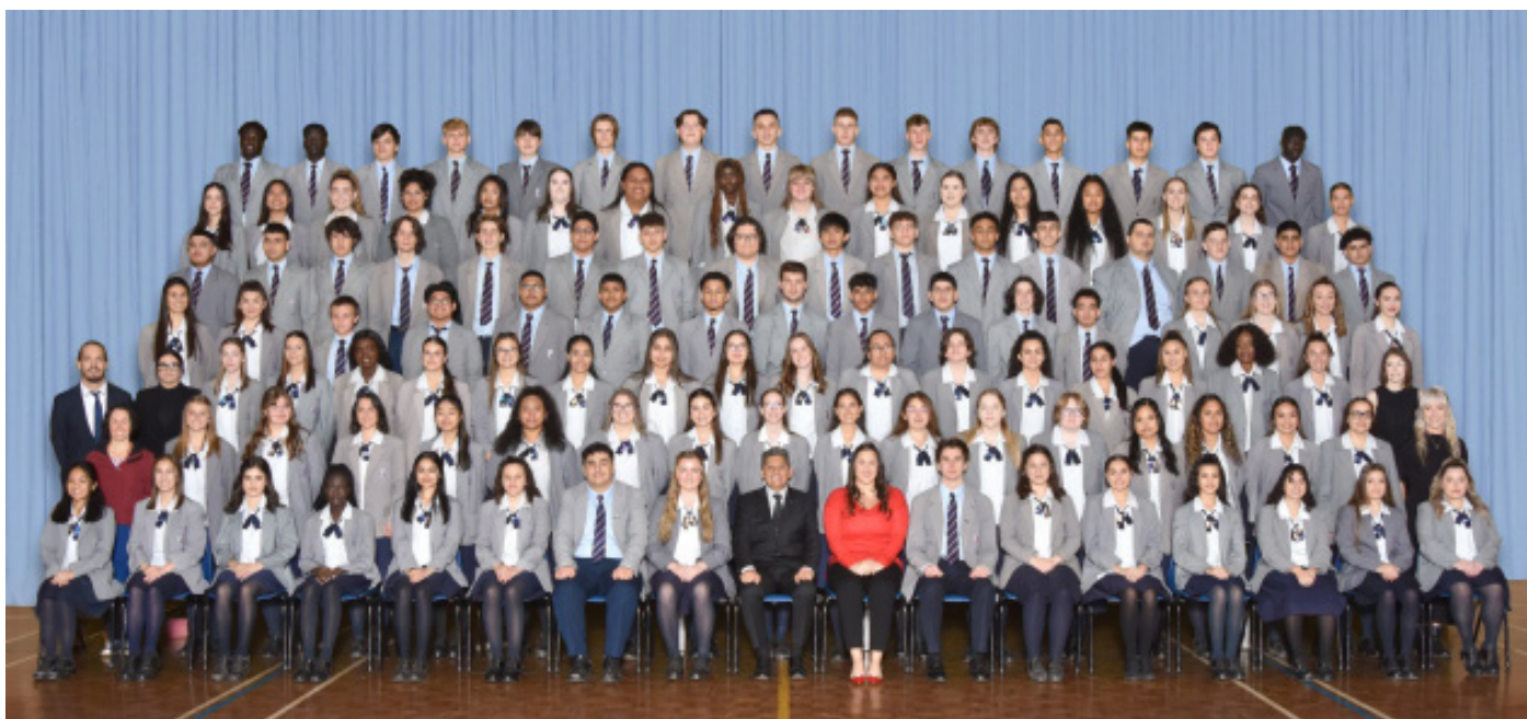
Photo: Year 12 Photo Day 2021

Previous Years' photos - Past years' photographs including sports, co-curricular and representative groups are also available to order under the "previous years or group photo" tabs at your school's advancedorder site when you click on the "Order School Photos Here" button above. You can also order past packages, portrait images and gifts from your child's unique, individual and secure advancedyou image archive site using the unique 9 digit image code found on packages you have ordered in the past