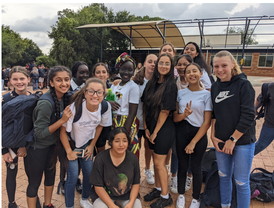
Photo: Multicultural Day 2021

Australia is a vibrant and multicultural country and as mentioned before this is represented at Emmaus – from the oldest continuous culture of our first Australians to the cultures of our newest arrivals from around the world. Our cultural diversity is one of our greatest strengths and is at the heart of who we are. It makes Australia a great place to live and Emmaus a great place to come to school.